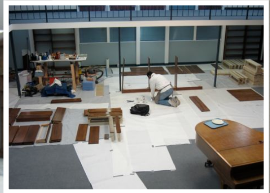
CHESTER WILLIAMS REFINISHING AND BUILDING SHELVES FOR THE GAA LIBRARY