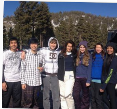
P.E. DEPARTMENT'S SNOW TRIP