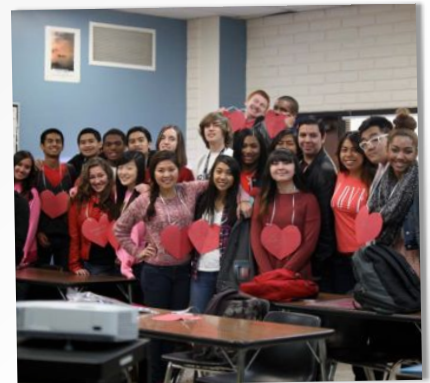
VALENTINE'S DAY SPIRIT DRESS