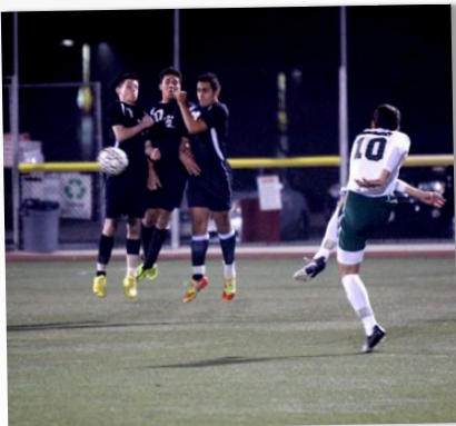
GAA MEN'S SOCCER TEAM